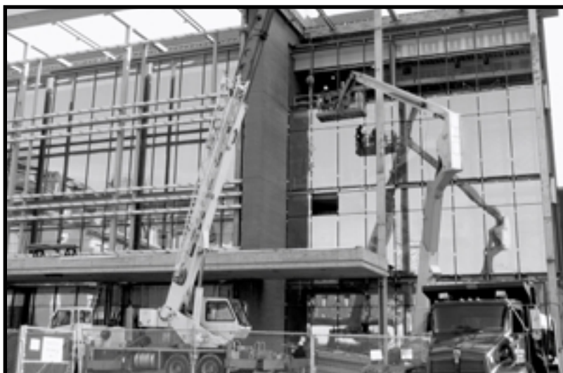
BMC's J. Joseph Moakley Building is in the final phases of construction and opens in September 2006.